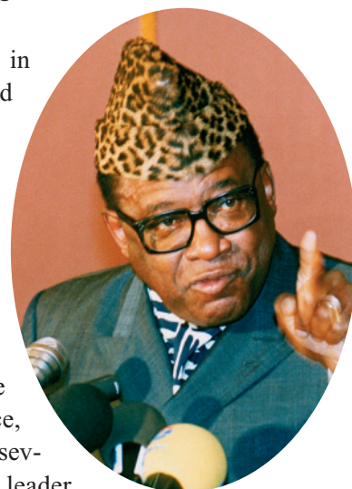
▲ Mobutu Sese Seko

B Why was the Congo vulnerable to turmoil after independence?